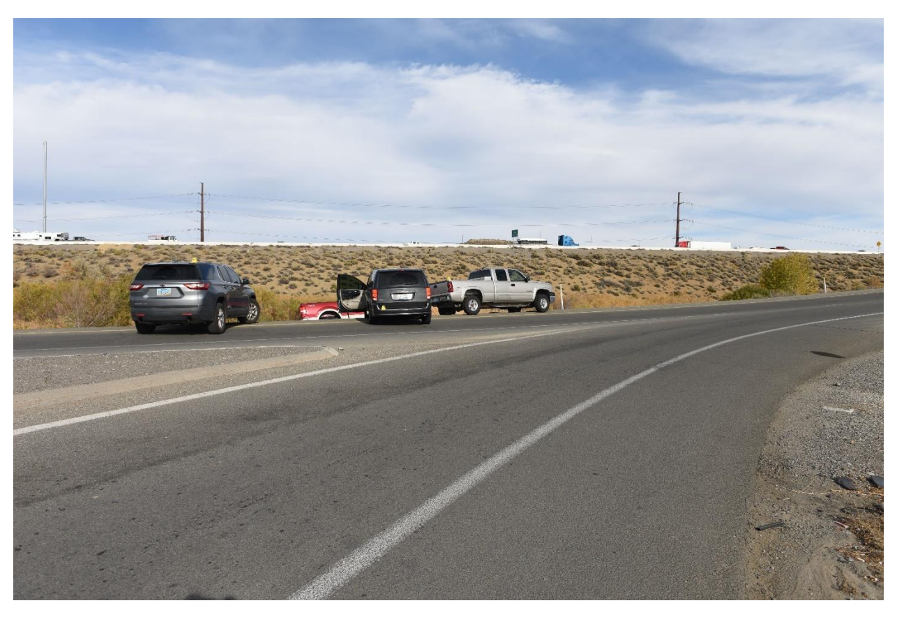
(Detective Bailey's gold truck is on the right side of the photograph with Detective Fye's gray van facing east with the driver's door open and Sergeant McNeely's gray Chevy Traverse parked to the north of Detective Fye's van. You can see the rear end of Thomas' red Ford truck parked facing south, directly in front of Detective Fye's minivan. The southern point of the median can be seen in the photograph where Detective Catalano ended up after being ejected from the vehicle.)

(The photograph depicts Golden Valley Road heading east. In the foreground is US 395 and in the forefront the median and grouping of vehicles located just south of the median which includes Thomas' red Ford Truck.)