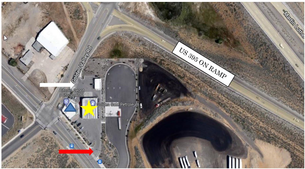
(Satellite view of the Golden Gate Petroleum Station. The red arrow designates the N. Virginia Street entrance/exit. The white arrow designates the Golden Valley entrance/exit. The store is indicated with a blue triangle and the gas pump's location are indicated by a yellow star.

gas station, accessed via Golden Valley Road, lies the southbound on ramp for US 395 which runs north south.