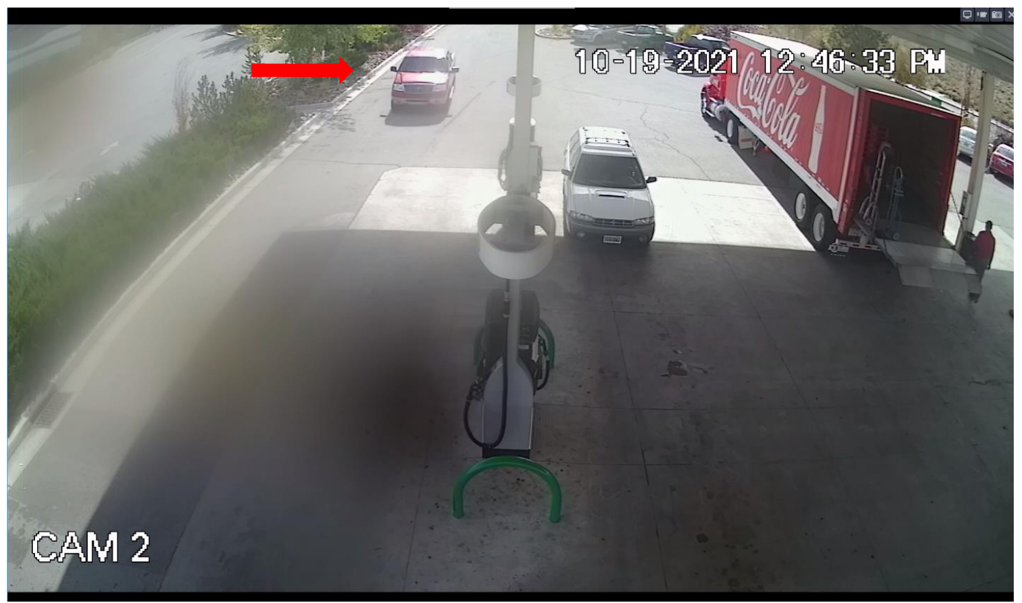
(Thomas' red Ford F-150 is shown here, indicated by the red arrow, entering from N. Virginia Street and driving through the Golden Gate parking lot. The truck initially stopped at the gas pump shown in the bottom middle of the photograph where Detective Fye initiated the traffic stop. Thomas then drove towards the exit/entrance located on Golden Valley Road.)

and past two gas pumps. This is the vehicle which Thomas was driving.