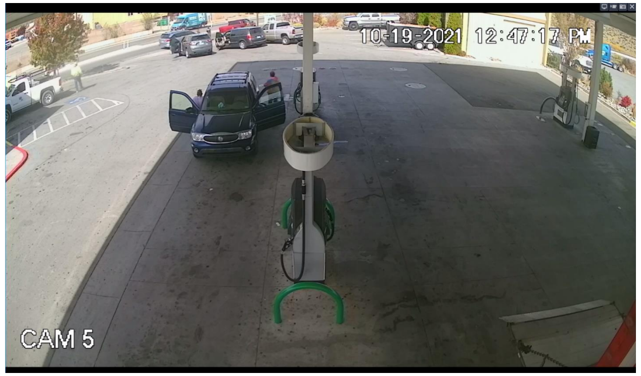
(This still image depicts Thomas' vehicle immediately after striking Detective Catalano's van and driving over a curb to flee police. Detective Catalano is trapped inside the passenger area of Thomas' red truck while the door remains open and swinging.)